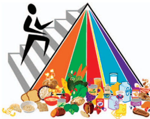
Fig. 1. Food pyramid. Copyright # 2007 American Diabetes Association. From http://www.diabetes.org . Reproduced with permission from The American Diabetes Association.