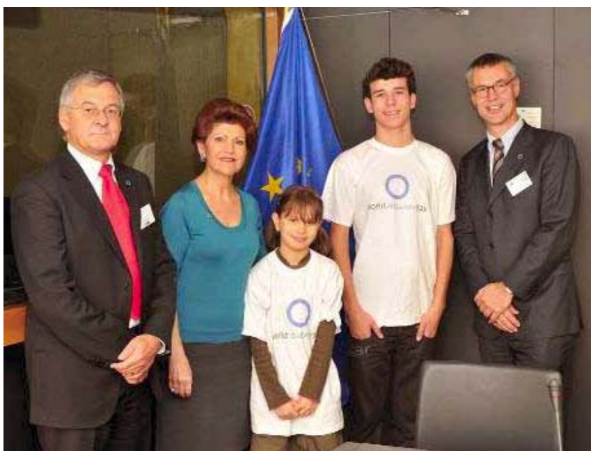
ISPAD Activities at the European Parliament

These initiatives have been brought to the attention of the political stakeholders. We have been invited to address the issue of childhood diabetes with EU Commissioner Vassileou and met with the Commissioner at the European Parliament during World Diabetes Day 2008. Also we have started initial talks with the Juvenile Diabetes Research Foundation which is the foremost research foundation devoted to type 1 diabetes worldwide. This year we have our first joint symposium with JDRF during the annual meeting and are proceeding with high level talks to further intensify our collaboration.