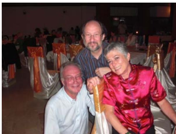
ISPAD Postgrad Course in Buzias, Romaina

http://www.ispad.org/FileCenter/record_ed_lectures_frame.htm